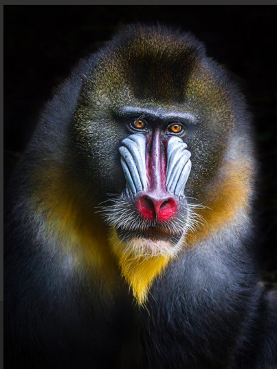
SALON HM | SURYAWATI ESTER, Indonesia, Mandrill