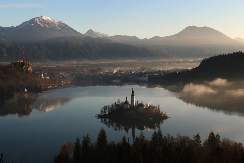
PCP HM | CATANIA GOTTFRIED, Malta, Lake Bled View 1