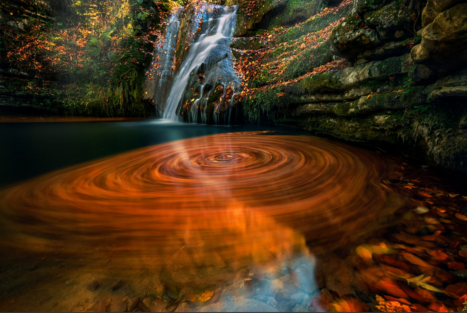
MAPA DIPLOMA 3rd | SEKER MEHMET TAYFUN, Turkey, Orange circles