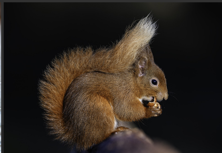
MAPA HM | DAVID REID, Scotland, Simply Red