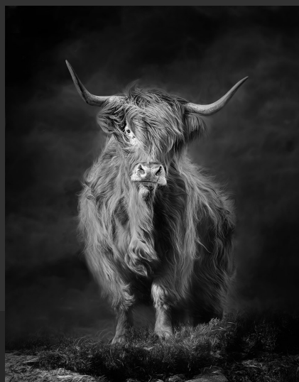
MAPA HM | WATSON GORDON, England, Heilan Coo