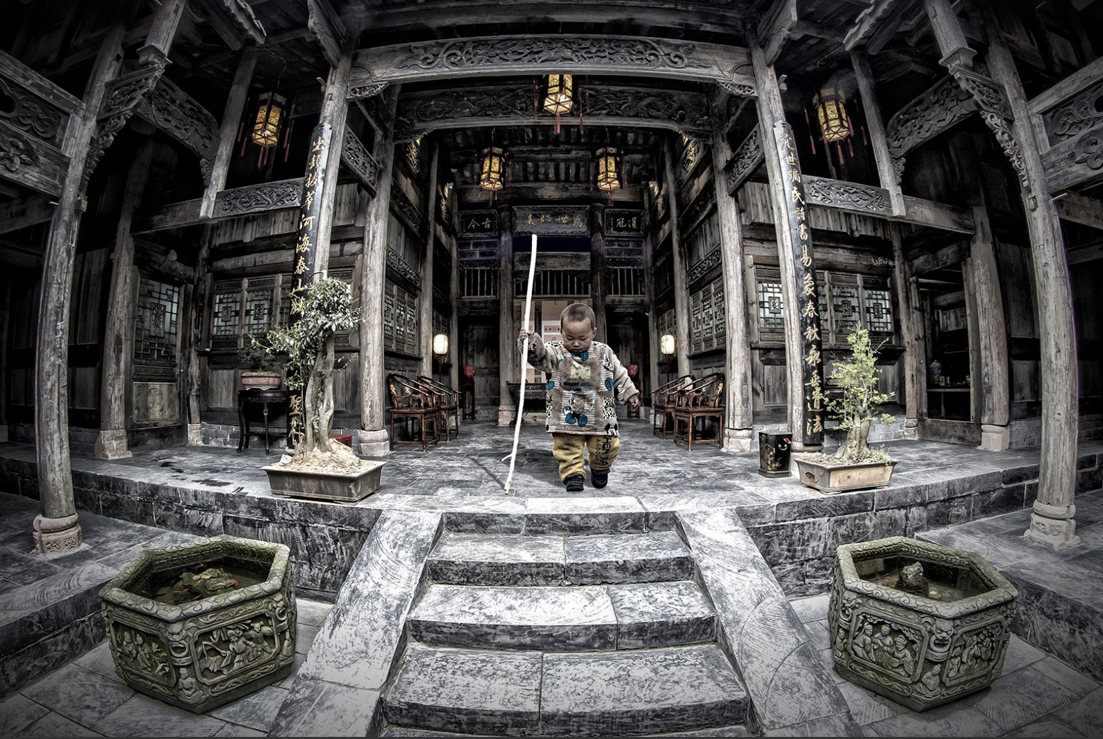
SALON DIPLOMA 1st | FLAVIAN SAVESCU, Romania, Temple boy