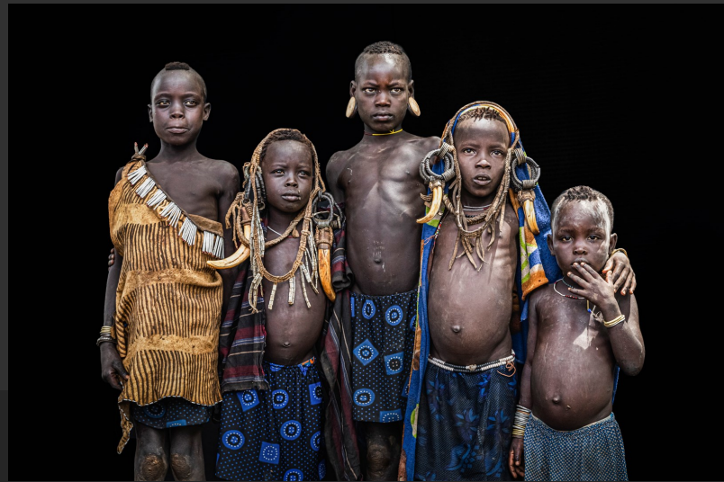
SALON HM | LI MIN, China, Portraits of tribes in Ethiopia