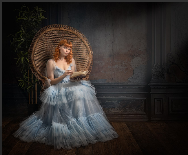
SALON HM | WATSON GORDON, England, The Reading Room