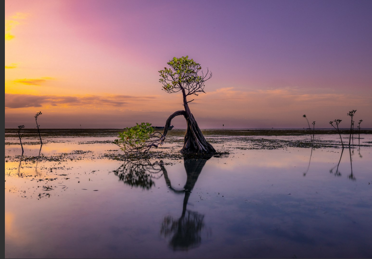
PCP HM | MUHTASIB MOHAMMED, Saudi Arabia, Dancing trees 2