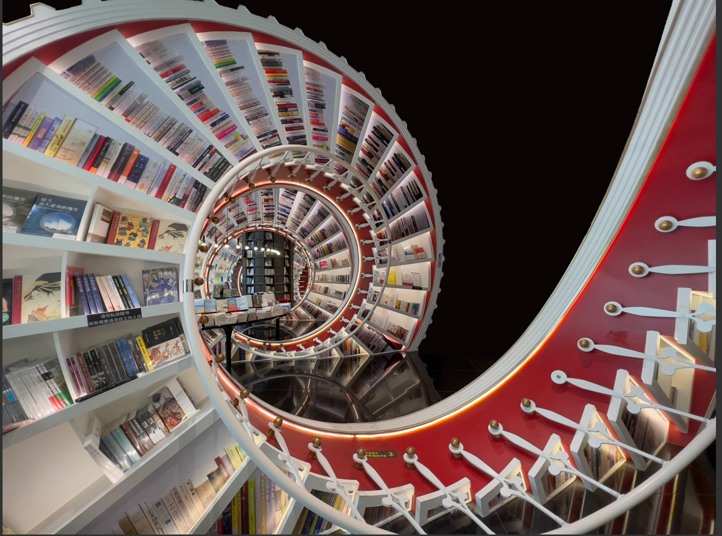
MAPA DIPLOMA 2nd | KING FRANCIS, Canada, Spiral Of Books