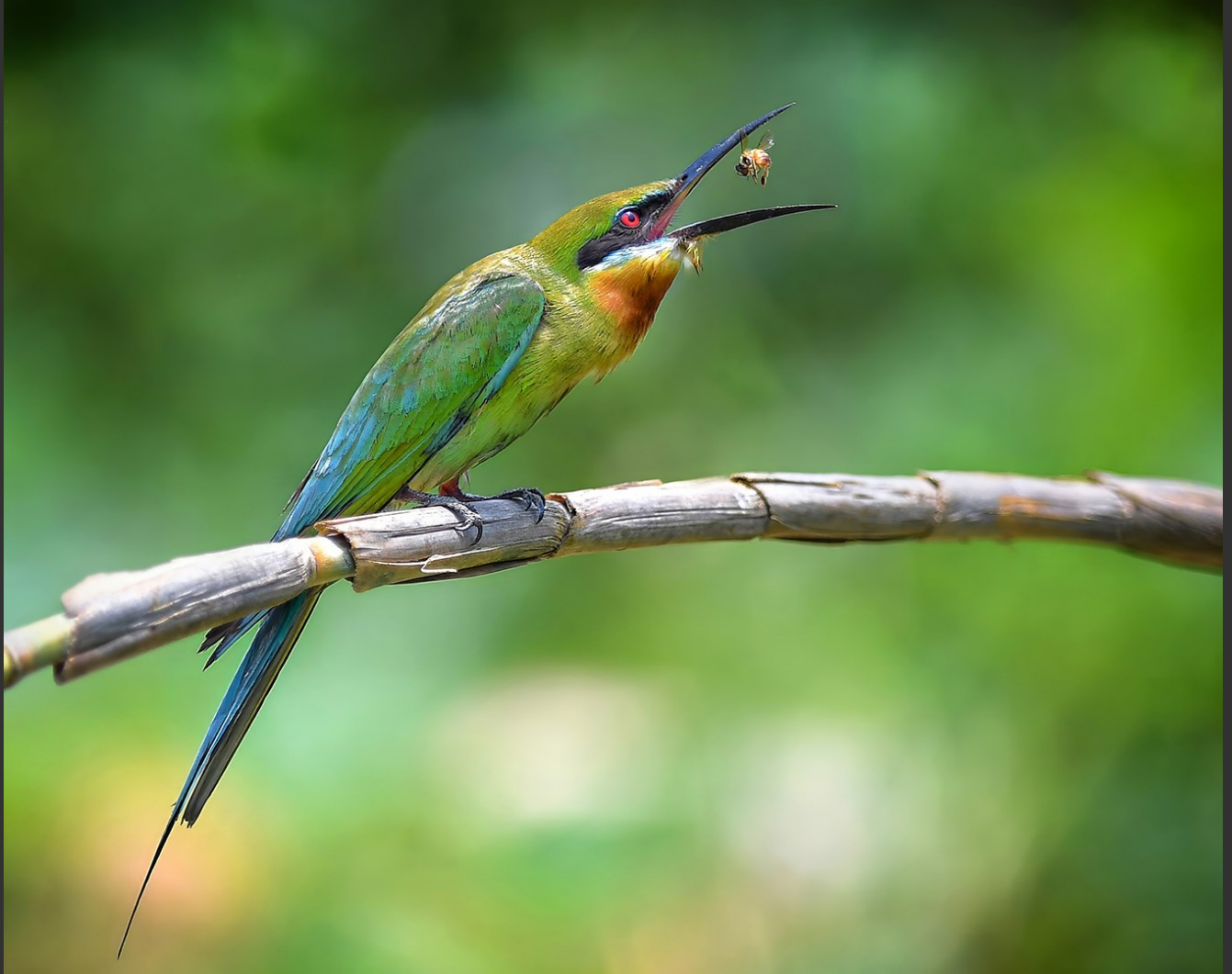
MAPA DIPLOMA 1st | TANG CHAN SENG, Macau, Meropidae 52