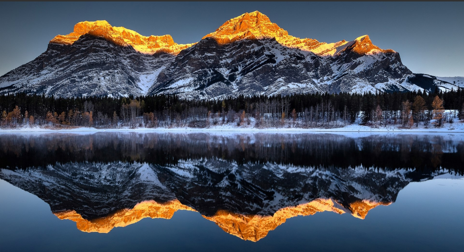
MAPA DIPLOMA 1st | ALAN BOYD, Australia, Wedge Pond Reflection