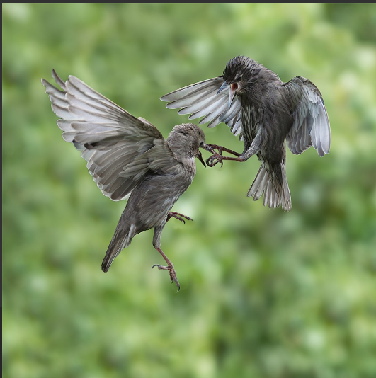
SALON HM | PAUL WAGSTAFF, England, Baby Starlings Battling Over Food