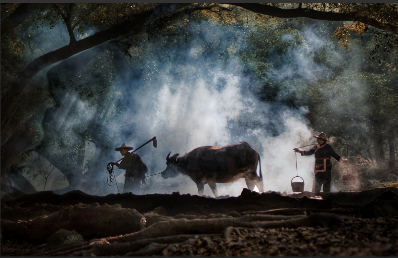
SALON HM | KEN ANG, Singapore, Early morning walk