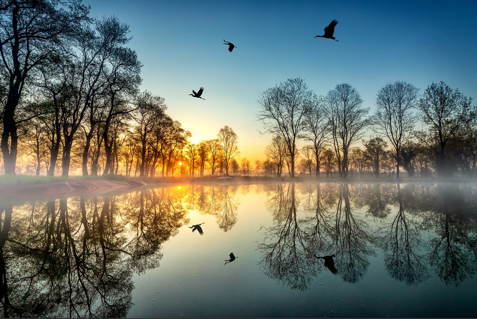
PSA Gold | SEKER MEHMET TAYFUN, Turkey, Birds and trees