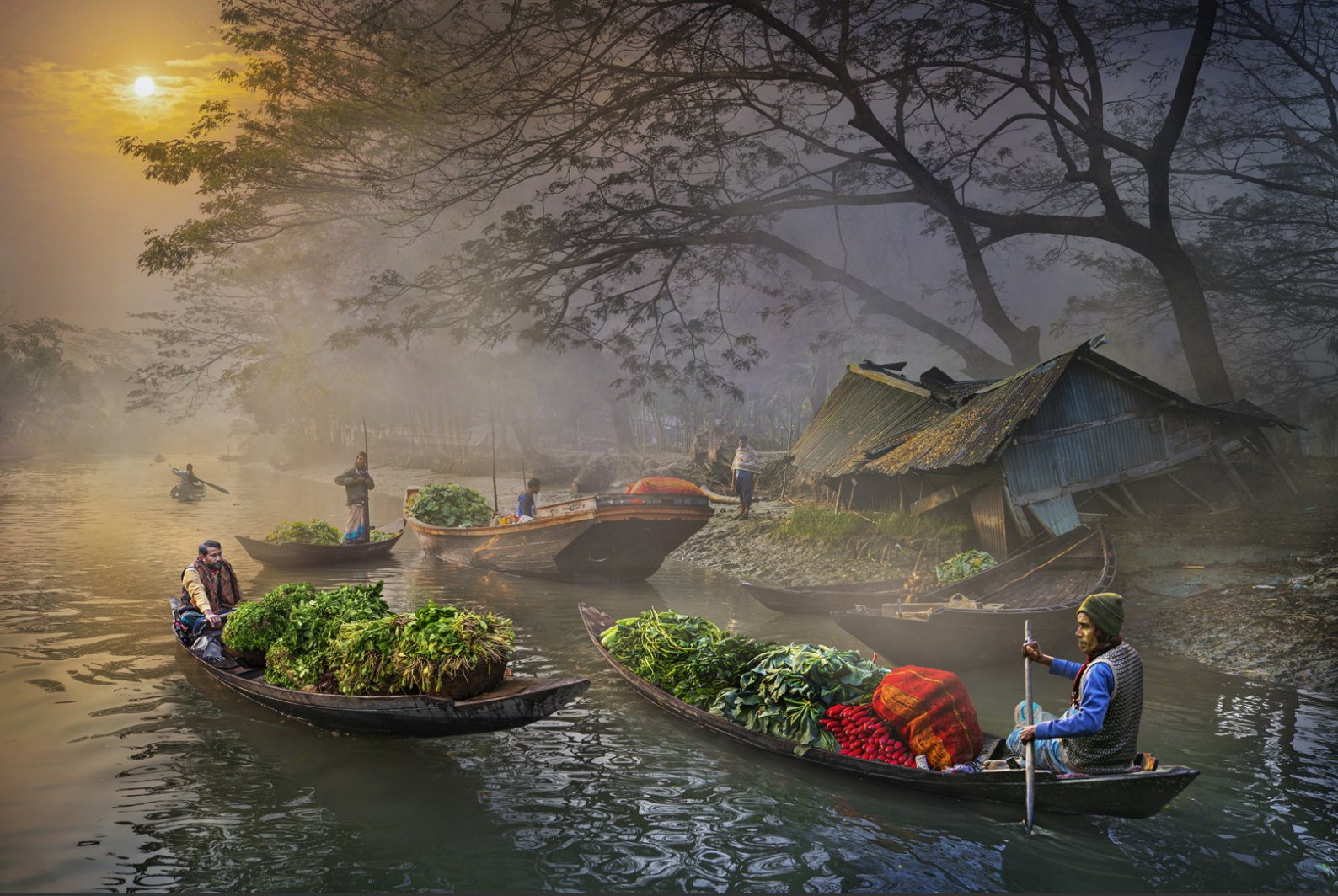
SALON DIPLOMA 1st | LEONG IM KAI, Macau, Waterway Transportation