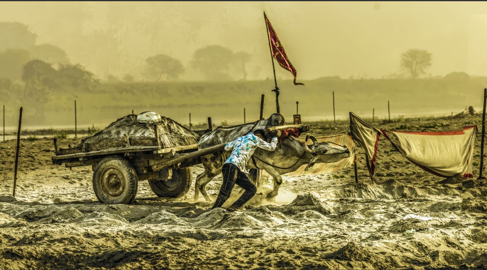
PCP DIPLOMA 2nd | PAL GOSZTONYI, Hungary, Hard work