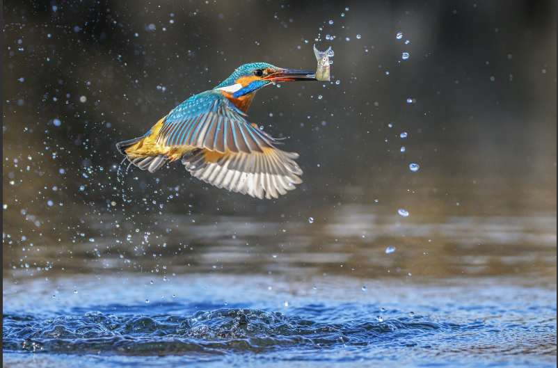
FIAP HM | ZSOLT NADUDVARI, Hungary, Flight with prey