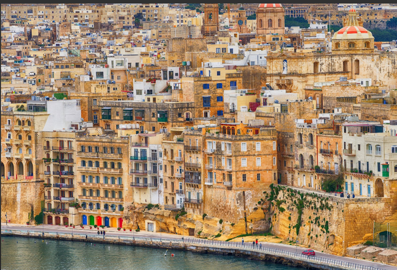
MAPA HM | VALENTINA STAN, Romania, Beauties of Malta