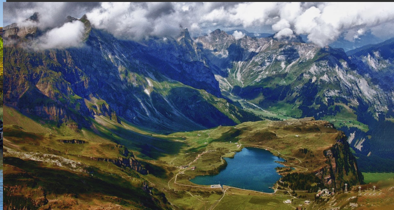
SALON HM | TANG CHAN SENG, Macau, Mountain Scene 3