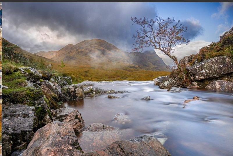
MAPA HM | MATTHEW HOAR, England, The Lone Tree