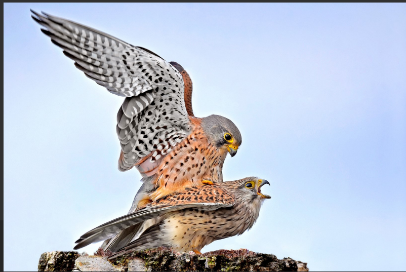
MAPA HM | RENE VAN ECHELPOEL, Belgium, Paarung Turmfalken