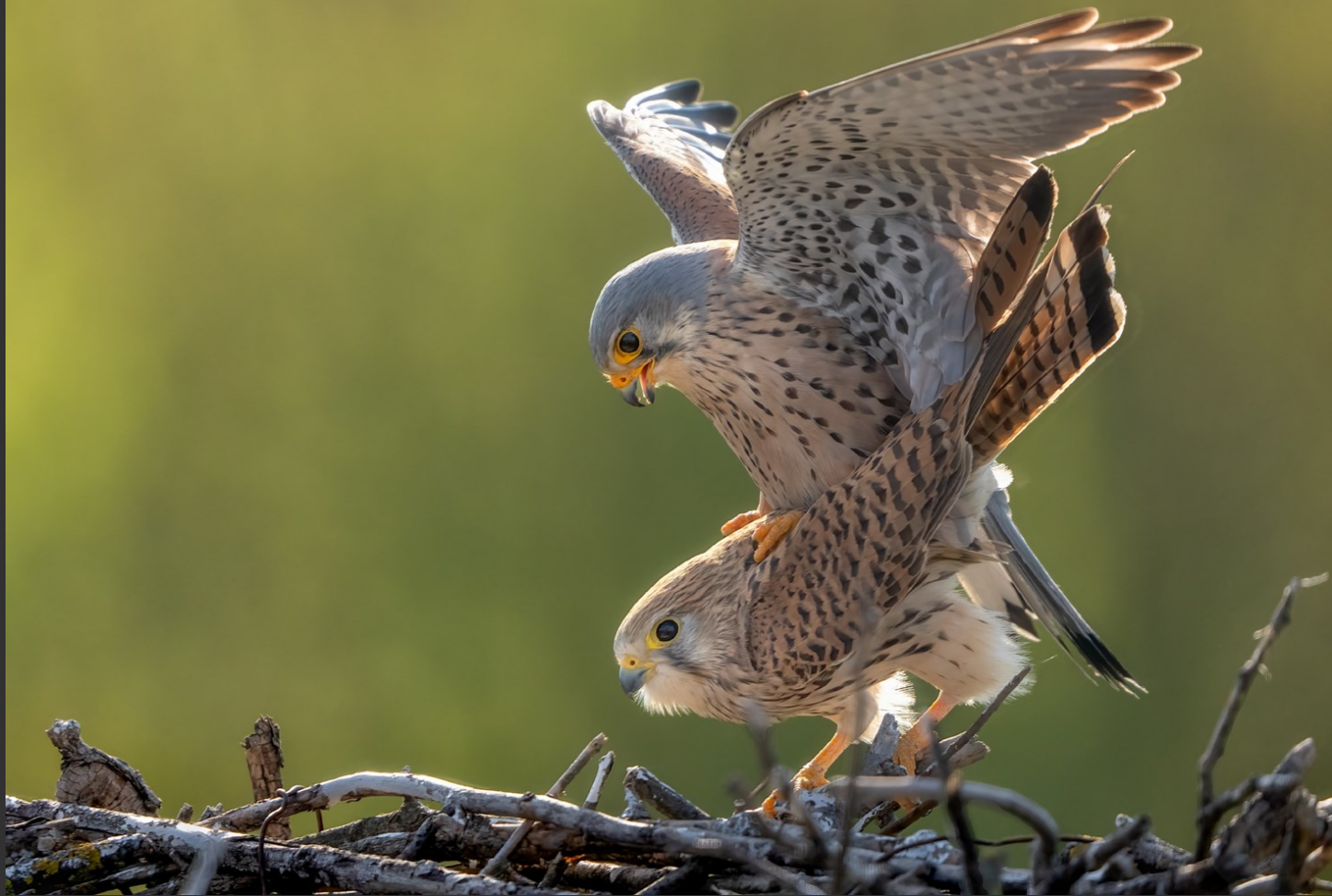
SALON DIPLOMA 3rd | LI MIN, China, Beautiful Bird 5