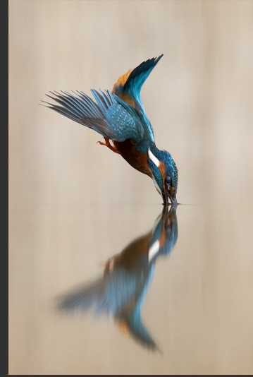
PCP HM | JENNIFER MARGARET WEBSTER, England, Kingfisher mirror mirror