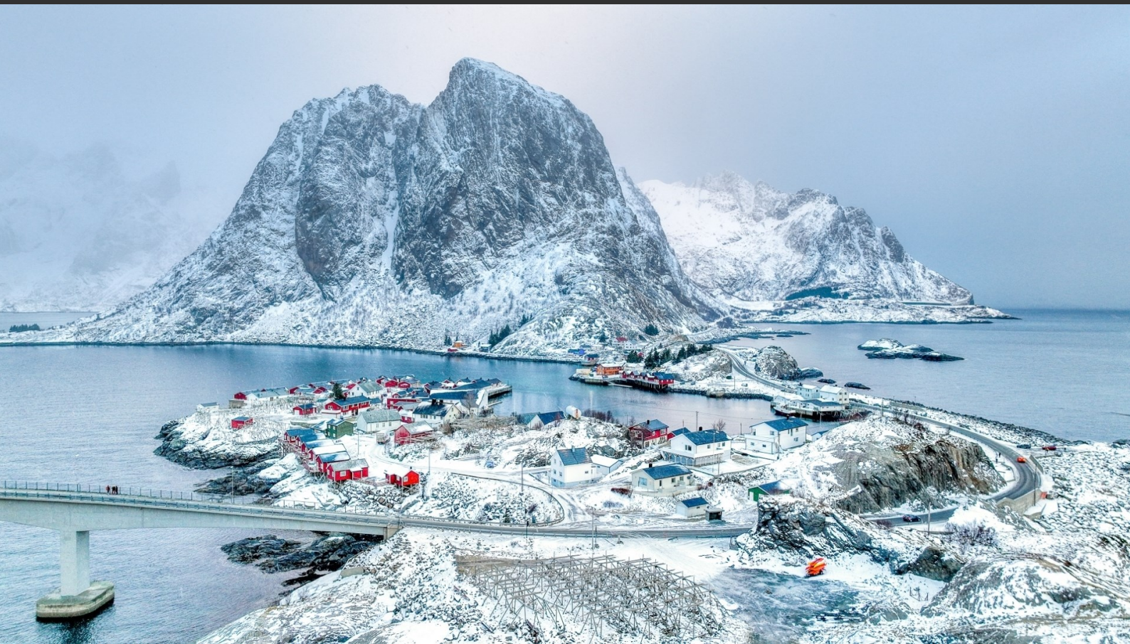
SALON DIPLOMA 1st | ALAN BOYD, Australia, Mountain behind the village