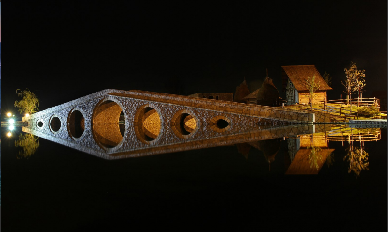
FIAP HM | FLAVIAN SAVESCU, Romania, Science fiction domestic