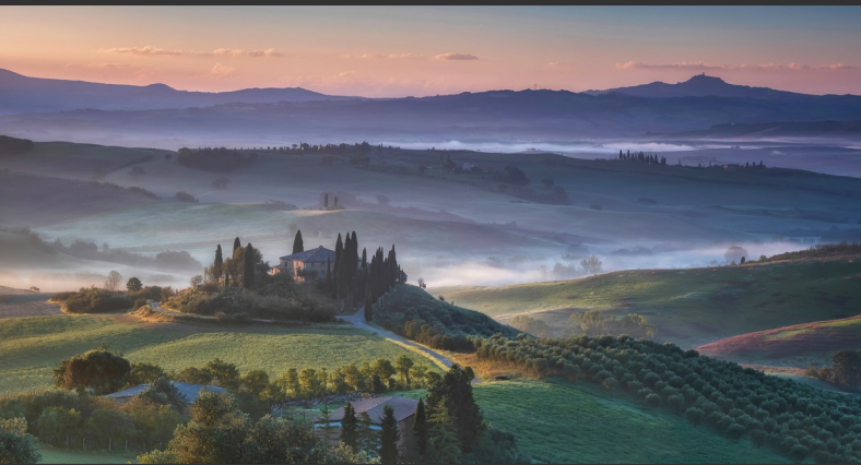
FIAP HM | WATSON GORDON, England, Misty Morning At Podere Belvedere