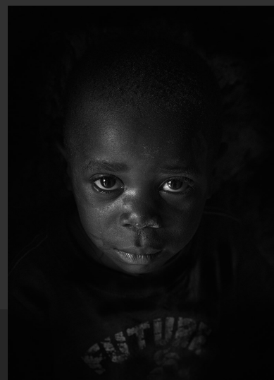
MAPA HM | SONJA MARINSEK, Italy, Batwa kid in Uganda