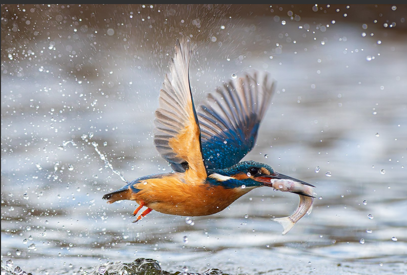
MAPA HM | ZOLTAN KRAHLING, Hungary, My favourite