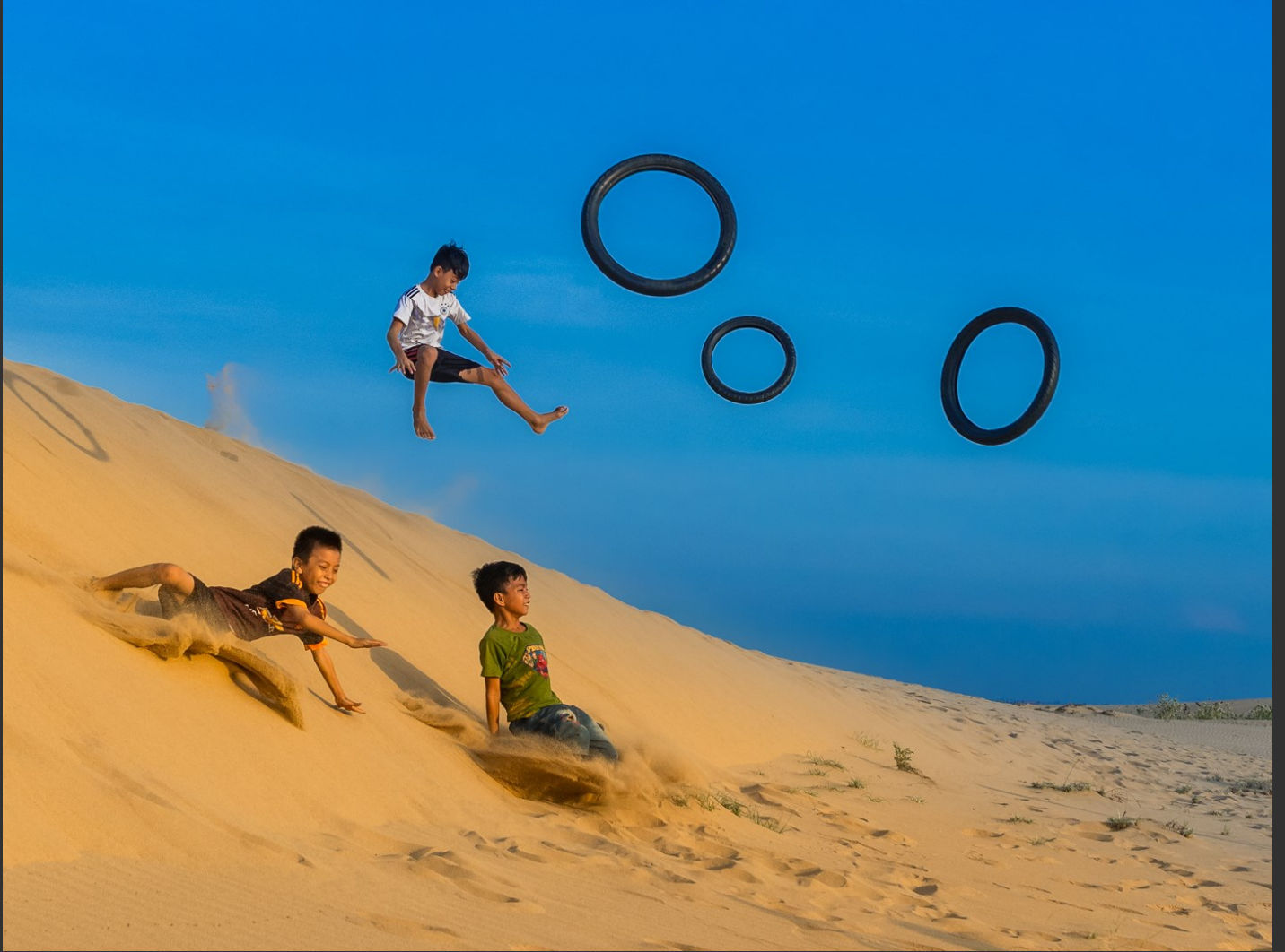
SALON DIPLOMA 3rd | KING FRANCIS, Canada, Boys Are For Summer 2