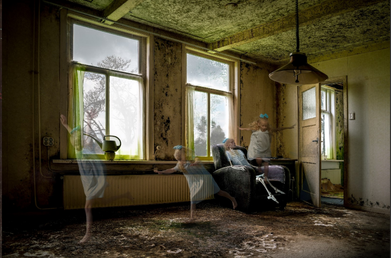
PCP HM | MINKE GROENEWOUD BEERDA, Netherlands, The Portal